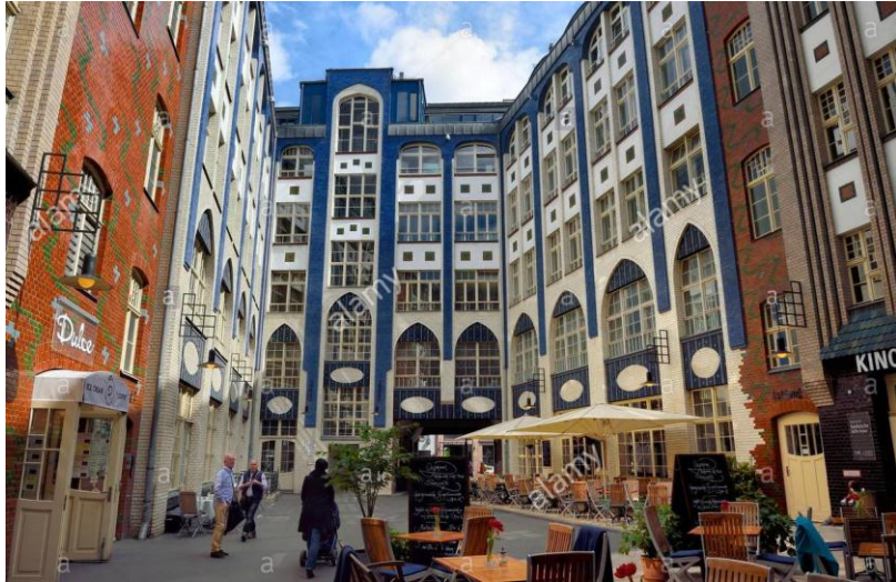
Heritage Conservation: Berlin's Historic Cored destroyed during the war Spandauer Vorstadt is beautifully restored today with cafés, shops & courtyard homes