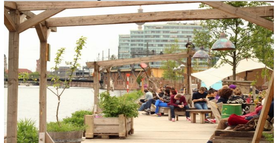
Creative Neighborhoods & Innovation Districts :Holzmarkt with living and working spaces, studios for artists, creative types and craftsman, trade, clubs, cultural sites, a restaurant, a new hotel and the Eckwerk start-up centre.