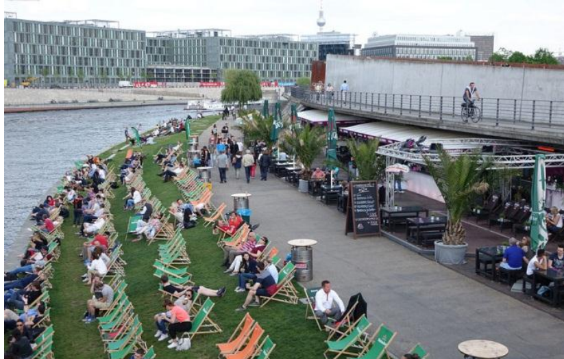
Europe's Smart Harborfront Makeover - Spree River Development