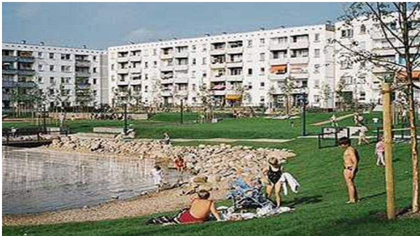
Housing Revival : Hellersdorf, one of the many East German suburban system built housing schemes with more than 400,000 apartments that are undergoing renewal.