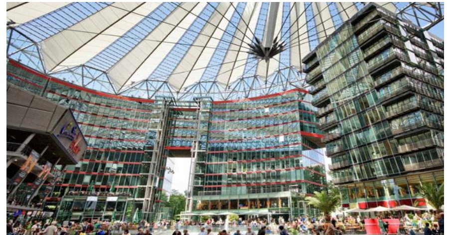
Potsdamer Platz – The Largest inner city Reconstruction in Europe. Renzo Piano designed DaimlerChrysler District and features architecture by renown practices such as Rafael Moneo, Mies van der Rohe & Richard Rogers.