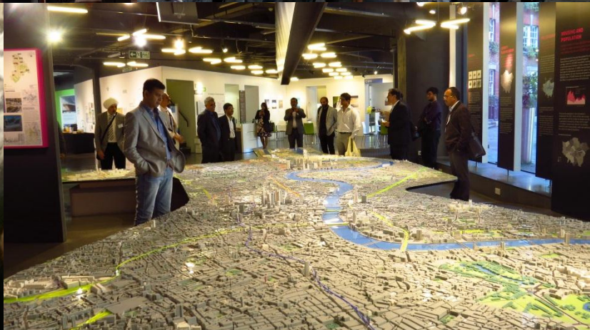
Past Programs: NYC , London ,Barcelona ,Madrid