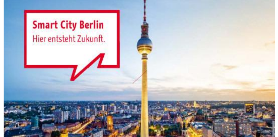
SMART CITY BERLIN A prototype for urban life in the 21st century. Examples of this include the "Zukunftsorte" (places of the future) in Berlin with Germany's most modern technology park, Berlin-Adlershof, is among the world's 15 largest science parks and is the most important science, business and media hub in the capital region.