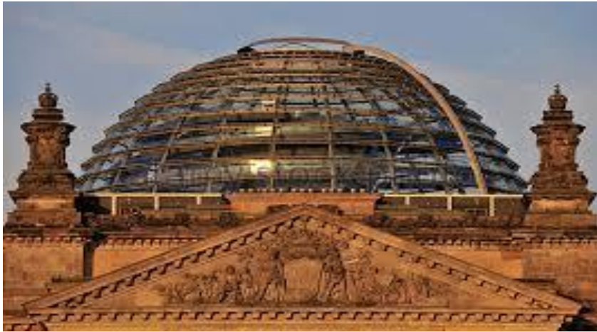
Old City Revival & new Public Architecture & Central landmarks like the Reichstag (with its new dome by Norman Foster) and the Jew Memorial by Libeskind