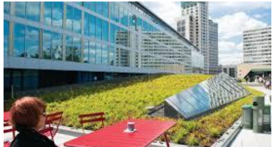
Sustainable Buildings & Energy Retrofits & Eco Suburbs