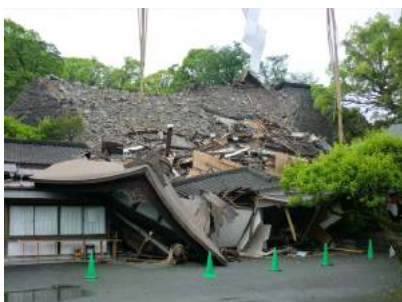
Kita-eighth tower collapsed during the Kumamoto earthquake.

The figures in this segment signify that natural disasters, including those exacerbated by climate change, continue to have menacing impacts for communities around the globe. In the Global South, these events can have a particularly devastating and lasting impact, setting back the development progress and compromising the wellbeing of present and future generations. This was best evidenced by the varied impacts of Hurricane Matthew in the USA -where it bore significant USD costs- and one of the poorest countries in the world, Haiti -where it led to large loss of life. The integrated approach to development and resilience enshrined in the SDGs, Sendai Framework, and Paris Agreement reflects these considerations and strives to anticipate a world where human safety, resilience, and wellbeing are part of one unified global priority. Cities and regions actively support this vision as the impact of disasters and long term stresses are often felt most directly in urban areas. Adapting an integrated approach to resilience and sustainability helps reduce avoidable losses and damages.