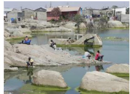
Lusaka, Missisi slums.

Last, the development of resilience-related standards, such as the ISO/NP 37123 Sustainable Development in Communities – Indicators for Resilient Cities, could bring cities and stakeholders together to fulfill the global goals. For example, the participation of Taipei City Government, Chinese Taipei in the ISO37120 program helped increase the City's ability to leverage funding for climate resilience and accelerate bottom-up implementation of the SDGs.