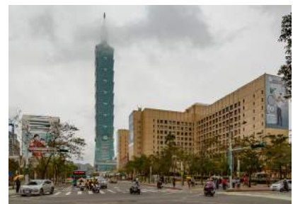
Taipei City Hall and 101 Tower.