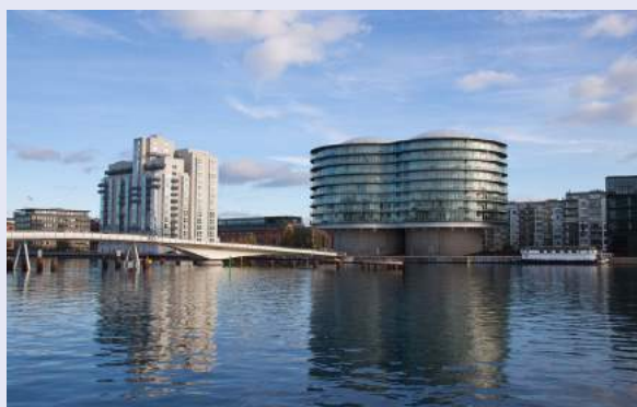
Copenhagen, harbour kayak.

1. Financing constraints: Raising taxes and redirecting earmarked gray infrastructure funds have been filling the gap, however, keeping taxes low while implementing high-quality projects could compromise future economic development. The storm surge plan will likely also require national legislation changes and innovative public-private partnerships to avoid