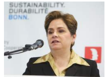
Patricia Espinosa, Executive Secretary, UNFCCC and Co- Patron of Resilient Cities 2017.

What remains is to bring the pieces together, by strengthening cooperation between and amongst sectors and governments at all levels that is underpinned by inclusive, transparent governance mechanisms.