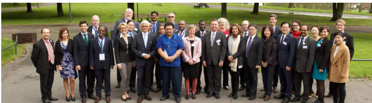
Mayors' Lunch during Resilient Cities 2017 congress with local leaders and UN officials (see page 26).