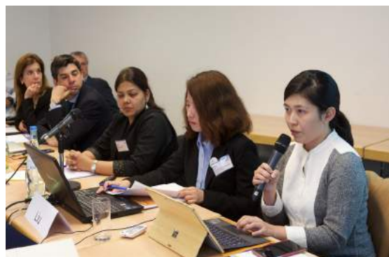
Session Integrating ecosystem-based adaptation and ecosystem services into urban management strategies.