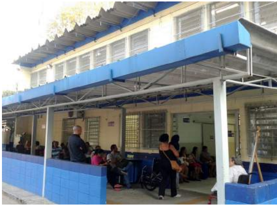
Ambulatory Medical Care (UBS / AMA) of Vila Nova Jaguaré, São Paulo, SP, Brazil.

Climate change is expected to exacerbate existing health problems, by disrupting water and food supplies for example, while creating new challenges including increased exposure to disease vectors, water borne diseases, undernutrition, and air pollution (IPCC, 2014). The World Health Organization (WHO, 2014) estimates it will cause approximately 250,000 additional deaths per year between 2030 and 2050 mainly due to diarrhea, malaria, childhood undernutrition, and heat exposure of elderly populations.