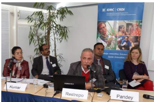
Innovative strategies for water management in fast-growing cities, examples from Kathmandu, New Delhi, Medellin and Belo Horizonte.

Dhulikhel and Dharan, Nepal provide two such examples. In Dhulikhel, only 48% of the population has access to piped water, while in Dharan supply is largely dependent on the rainy season and untreated sources. Tension often arises between different user groups including upstream and downstream communities. Most vulnerable in these traditional societies are women, who are responsible for the household and children. In order to address these challenges, projects like the Climate Adaptive Water Management Plans for Cities in South Asia brings key stakeholders together, including women, to plan integrated water management strategies (IDRC, 2017b).