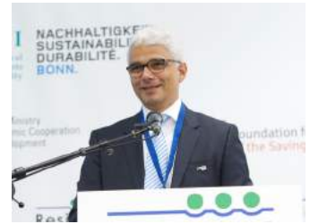
Ashok-Alexander Shridharan, Mayor of Bonn and Co-Patron of Resilient Cities 2017.