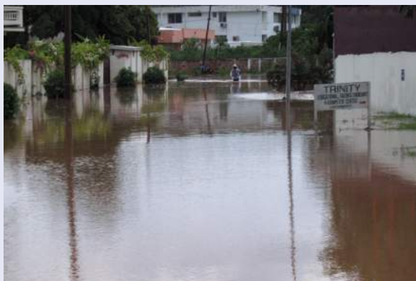
Flood in Accra.

The GAMA is prone to coastal and surface inundation, as well as related water and vector-borne disease epidemics. Rapid urbanization combined with poor spatial, water and sanitation, and solid waste management compound this vulnerability, resulting in high annual flood risk.