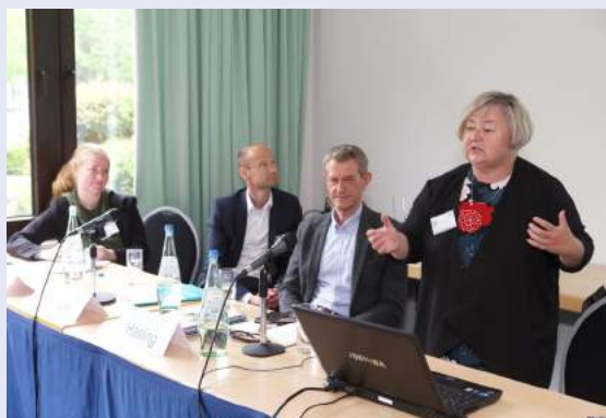
Reality Check Workshop Copenhagen, Denmark.