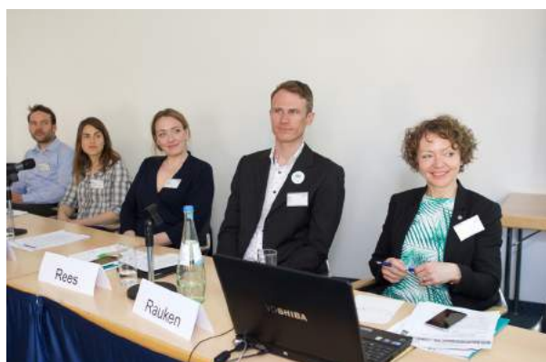
Session on Urban response to climate change and stormwater management in Oslo.