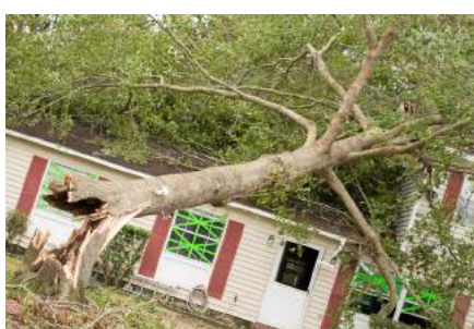
Hurricane Mathew knocked out electricity, left behind flooded areas and downed trees.