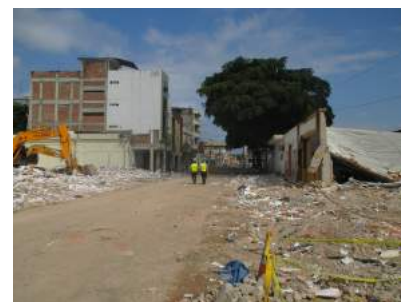
Zero Zone of Portoviejo affected by the earthquake in Quito, Ecuador.