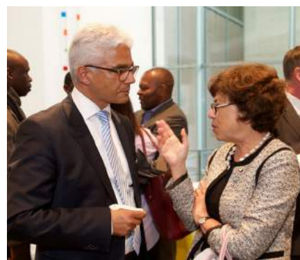
Mayor of Bonn, Ashok Sridharan with Executive Secretary of the United Nations Convention to Combat Desertification, Monique Barbut at the Opening reception hosted by the City of Bonn on May 4th.