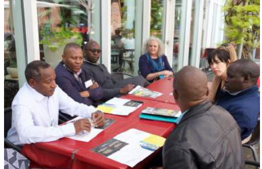
Networking meeting during Resilient Cities 2017.