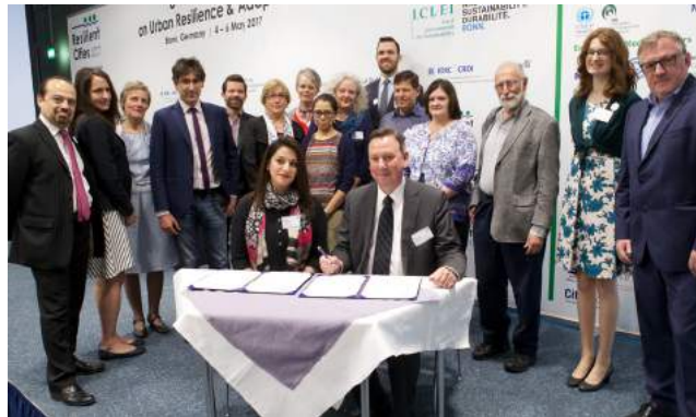
Memorandum of Understanding (MoU) between Urban Climate Change Research Network (UCCRN) and ICLEI during Resilient Cities 2017.

flooding . However, city administrators have limited capacity to check the accuracy of such data, especially during a disaster. Data platforms can also have a limited reach, especially in the Global South. This can be addressed with easily-accessible websites, apps, and mechanisms tailored for people from different backgrounds and vulnerabilities. In this regard, it is also critical to develop a practical and agile approach to managing urban resilience through open data and to involve multiple stakeholders with varied capacities and expertise. The government can foster an environment of innovation, civil society can connect people and bring up new initiatives, and the private sector can provide the technology to embody "open resilience". Finally, researchers must also help policy-makers stay abreast of emerging climate change data and research developments (see box on page 22).