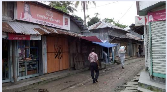
Gazipur Bandar, Bazaar.

Gazipur, with a population of 2.1 million, is located north of Dhaka and currently is the most dominant industrial area in Bangladesh. Rapid urbanization has outpaced infrastructure services, including for waste management. Textile factories, hospitals, and residents dump large volumes of toxic and infectious waste indiscriminately in illegally dump sites. Waste frequently clogs open drains, contributing to urban inundation, as well as overflowing pit latrines and septic tank systems after heavy rain. As a result, Gazipur faces elevated risks from water-sanitation related diseases, especially amongst the most vulnerable residents.