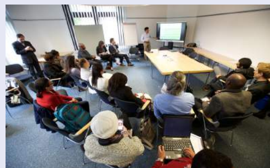
Reality Check Workshop: Quito, Ecuador.