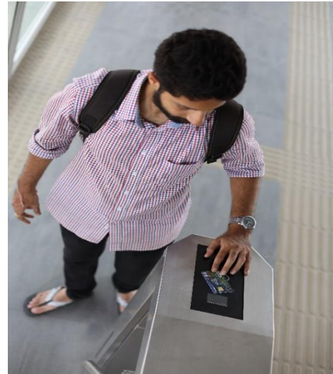
Use of Janmitra Card on BRTS station