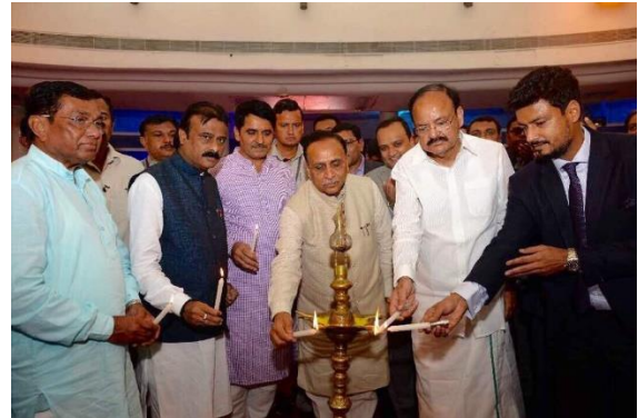
Launch of Janmitra Card