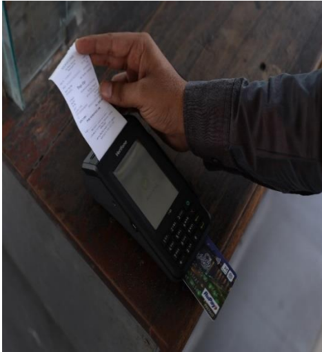
Janmitra Card is used in buying

This card enables access to electronic payment infrastructure services to all strata of society and make itself available at every nook and corner of the city. It also aids in green travel initiative. Commuter can use CCPS payment instruments for travelling from one place to another without getting into long queues to buy tickets through cash. This project is bringing a behavioral change In the citizens and minimizing the cash transactions across the city also absorption of this payment scheme is reducing the leakages in the system as every transaction under this system have an electronic footprint.