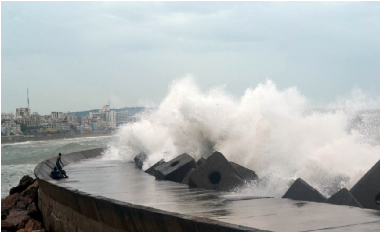
Fig. 3: Storm surge during Hudhud.

1.5. The Cyclone Hudhud caused extensive devastation in the affected districts, wherein large number of trees were uprooted, roads and buildings were severely damaged, and power and telecommunication infrastructure was disrupted.