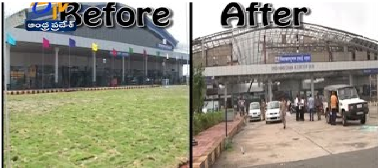
Fig. 8. Vishakhapatnam Airport before and after cyclone Hudhud.

Figure 8 depicts the position of Airport before and after Cyclone.