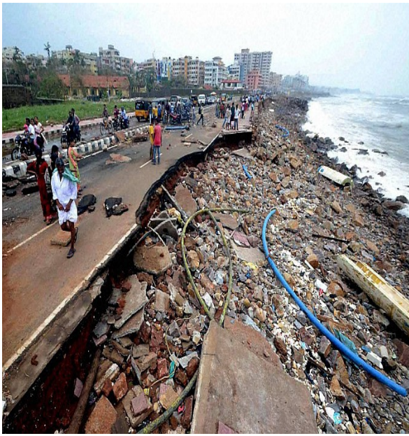
Fig. 4. Damaged Road.