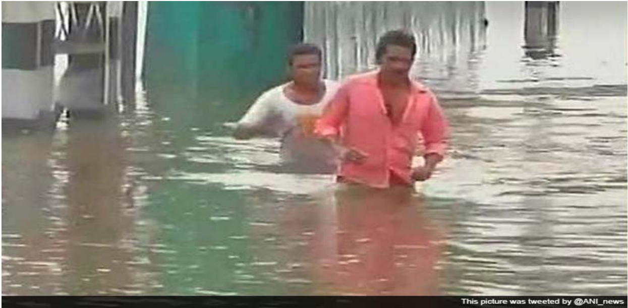
Fig. 2: Floods after Hudhud.