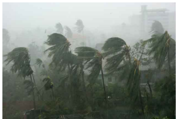
Fig. 10. Effect of high wind velocity on Tall trees.