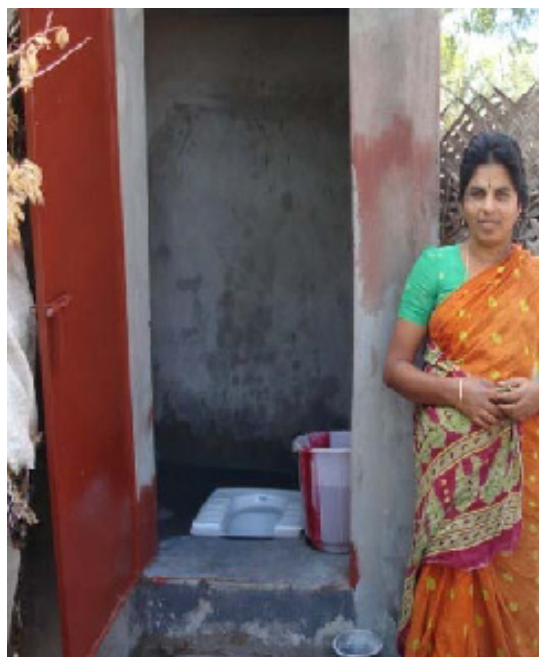
Individual Household Toilet

The success of Women's SHG managed toilets has encouraged the Tiruchirapalli City Corporation to hand over half the city community toilets to SHGs for maintenance. Over the course of 6 years, the management of almost 170 community toilets have been successfully taken over by the Women's SHGs with support from Tiruchirapalli City Corporation demonstrating how women not only learned but are implementing new skills acquired through participation and involvement. The project has promoted women as leaders, and trained them as community managers. As a result, these women are now well respected and their opinion is valued in the society.