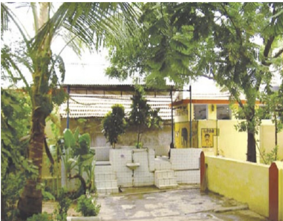
Community Toilets Maintained by Women Self Help Group

After initial resistance to the cause, men from the community also became interested leading to their participation in the action. Consequently the Association for Water, Sanitation and Hygiene (AWASH) was formed where men, as well as women, contributed to water and sanitation improvements within the community. A children's group was also formed though they were targeted only for behaviour change communications (BCC).