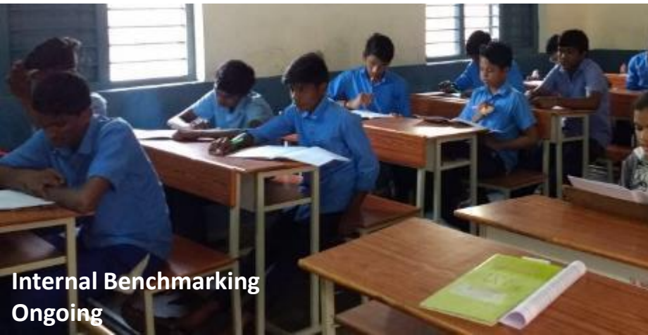
Internal Benchmarking Ongoing