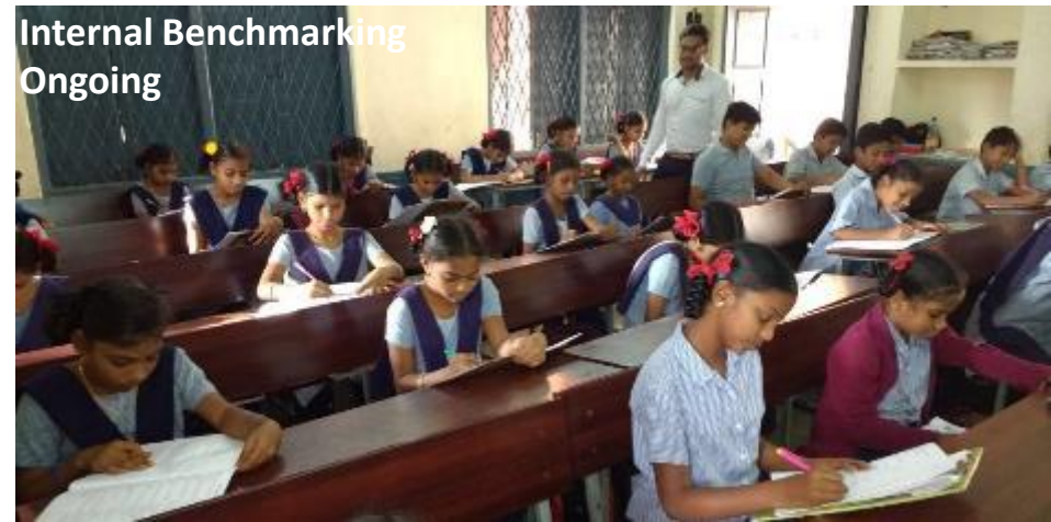
Internal Benchmarking Ongoing