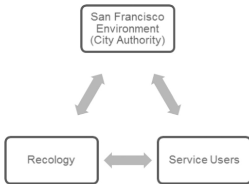
Fig. 1. San Francisco's zero waste governance structure.

Developed from Silva et al. (2016) pp 229.