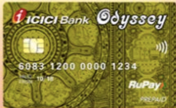
ODYSSEY CITY CARD