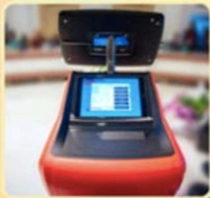
MY ODYSSEY CENTRE