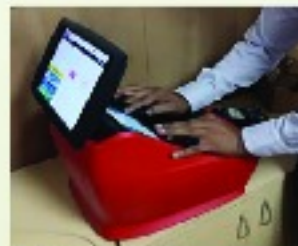
My Odyssey Centre