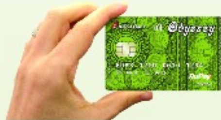
Odyssey City Card

The card is intended to facilitate payment transactions for citizen services across the city through My Odyssey Centres - micro-payment centres with dual interface machines.