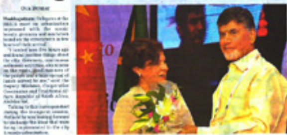
Delegates from BRICS countries at the inauguration of the three-day BRICS Urbanisation Summit in Visakhapatnam on Wednesday.

BRICS NEWS SERVICE The Union Minister for Urban Development, M. Venkaiah Naidu, said at the inauguration of the three-day BRICS Urbanisation Summit in Visakhapatnam on Wednesday that the government is committed to providing world-class infrastructure and services to its citizens. He said that the government is focusing on providing world-class infrastructure and services to its citizens.