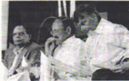
Union Minister for Urban Development M. Venkaiah Naidu (left) and Chief Minister N. Chandrababu Naidu (right) at the inauguration of the three-day BRICS Urbanisation Summit in Visakhapatnam on Wednesday.

BRICS countries have gone through difficult times in their transition from rural to urban and infrastructure is a big challenge