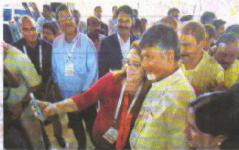
A delegate from Brazil takes a selfie with Chief Minister N. Chandrababu Naidu after the inauguration of the three-day BRICS Urbanisation Summit in Visakhapatnam on Wednesday.

VISAKHAPATNAM: With BRICS economies identified as some of the fastest-growing countries and accounting for 53 per cent of the world's population, urbanisation was an opportunity and key challenge for them. Union Minister for Urban Development M. Venkaiah Naidu said here on Wednesday.