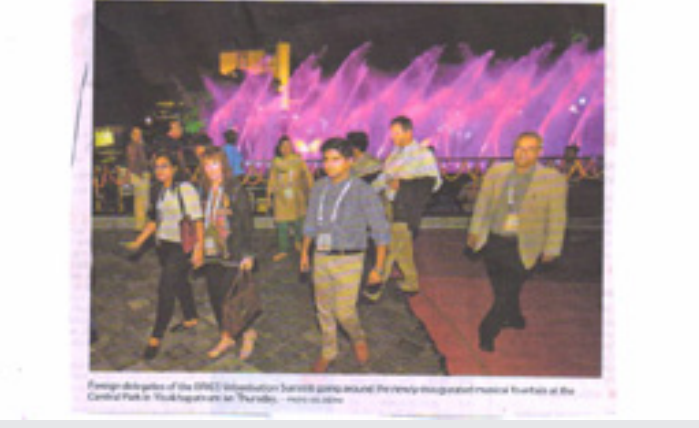
Foreign delegates of the BRICS Urbanisation Forum (BRICS-UAF) during the opening ceremony of the event at the Central Park in Vishakhapatnam on Thursday.