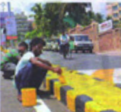
Workers paint bollards on the beach road, in part of beautification for BRICS, Sunday in Visakhapatnam.

SPECIAL CORRESPONDENT Vizag, Sept 12 In the run-up to the 3rd BRICS Urbanisation Forum, Vizag, Sept 12. The city of 60 lakh will undergo a facelift ahead of the summit. Vizag Municipal Corporation (Vizag M.C.) is working to improve the city's image.