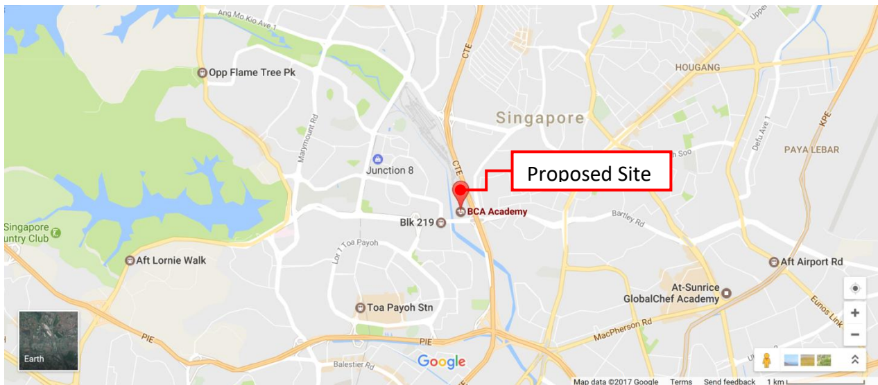
Key Plan (Google Map)

The site chosen for International BIM Competition 2017 is at BCA Academy, Block C and Block D, 200 Braddell Road, Singapore 579700.