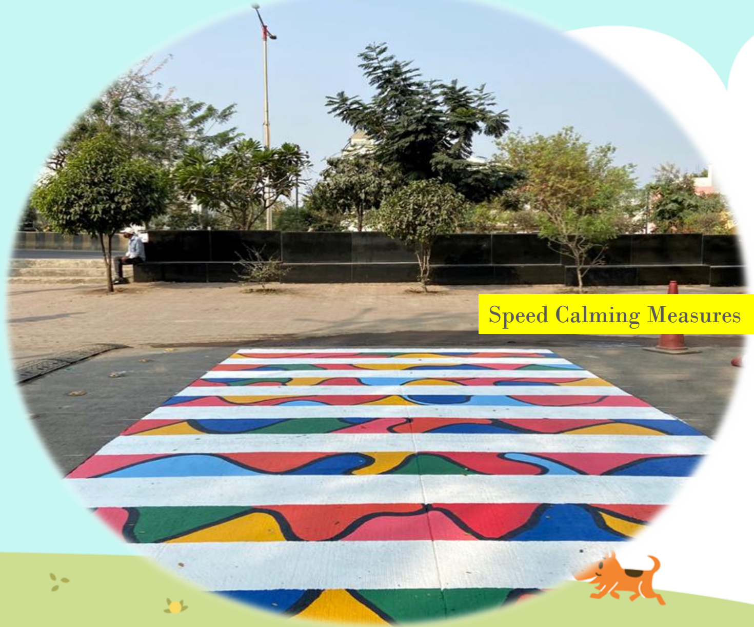
Speed Calming Measures