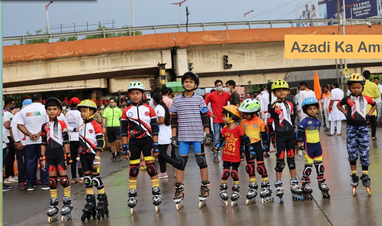
Azadi Ka Amrut Mahotsav