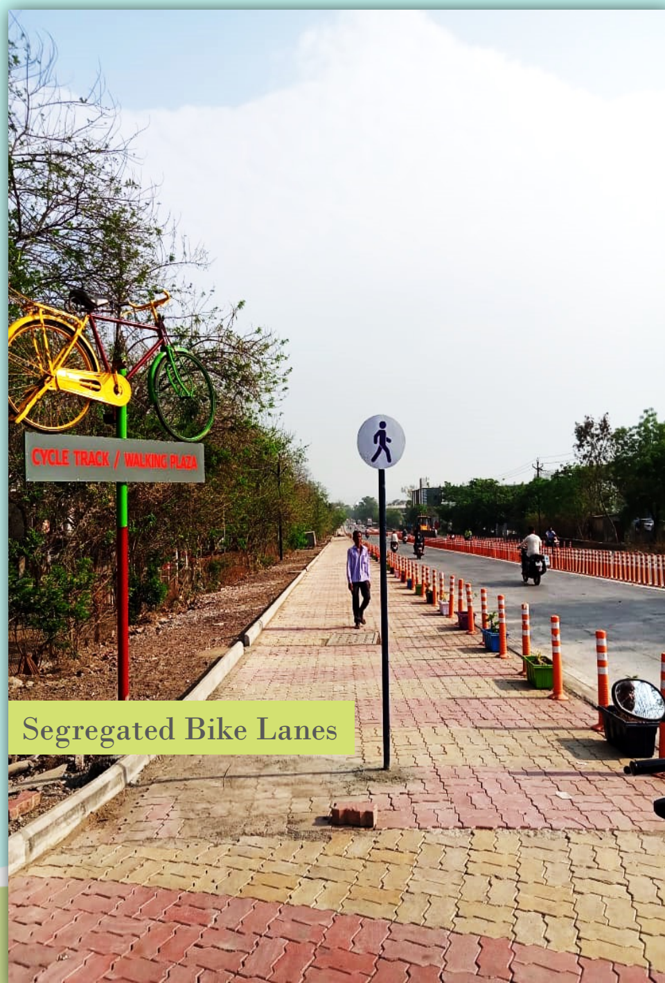
Segregated Bike Lanes